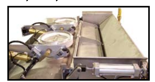
Mixer Top Canopy With Multiple Flour Inlets and Sponge Door